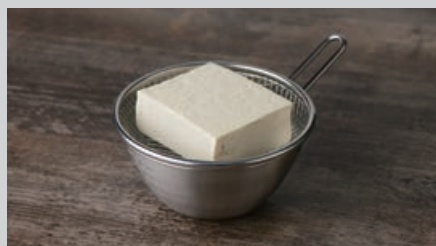
and Stainless Steel Handled Bowl 16cm AN0213 4979487 402132

A hand-handled bowl, approximately 16cm in size, designed for easy mixing and kneading with its deeper structure. The attached handle ensures stability, facilitating smooth mixing actions. Dishwasher safe.