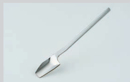
AN0206 and stainless jam spoon 4979487 402064

The jam spoon is designed to scoop jam from jar shoulders and bottoms in a neat and tidy manner. Allows for smooth scooping and spreading. Also useful for butter and dips. Made of stainless, making it easy to clean and maintain.