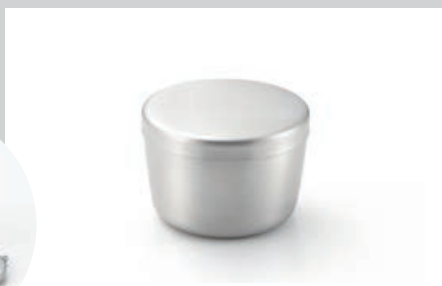
AN0202 and stainless round can 4979487 402026

Mini round cans with a diameter of about 6 cm. Made of stainless steel, it is odor-resistant and easy to clean, can be used for storing leftover garlic, chopped green onions, etc.