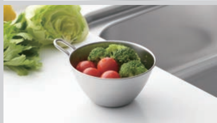
and stainless bowl with handle AN0205 4979487 402057

Mini bowl of approx. 13 cm. The bowl has a handle for stability and smooth mixing. Can also be hung for storage. Convenient size to handle with ease. Dishwasher safe.