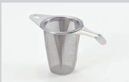
AN0216 and Stainless Slim Tea Strainer 4979487 402163

A deep tea strainer that allows you to directly infuse tea into bottles or cups. Its slim design makes it convenient for individual servings without the need for a teapot. The self-standing feature adds to its practicality. Dishwasher safe. *Please use with bottles having a diameter of 4.5cm or more.