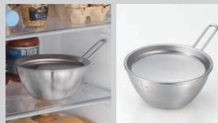
and Stainless Steel Tray 16cm, Doubles as a Bowl Lid AN0214 4979487 402149

A convenient stainless steel tray for prepping ingredients. Perfectly fits the 16cm handled bowl and serves as both a lid and a receptacle for the shallow strainer (16cm). Its stainless steel construction ensures easy maintenance. Dishwasher safe.