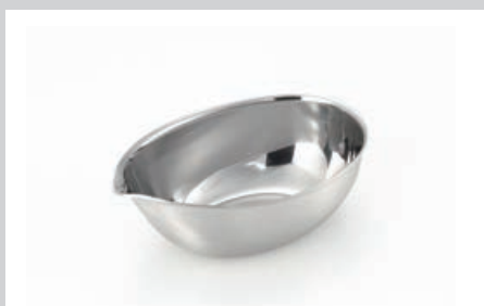
AN0204 and stainless oval type mini bowl 4979487 402040

Designed in the shape of a droplet, this mini bowl fits in the palm of your hand. Perfect for serving sauces and jams at the dinner table. This delightful size is perfectly suited to serving as a seasoning container or as a tool to aid short cooking sessions.