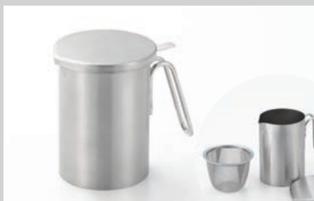
AN0201 and stainless mini oil pot 4979487 402019

Functional small oil pot. Perfect size for temporarily storing food leftover oil from frying. Lid is detachable for easy cleaning or maintenance.