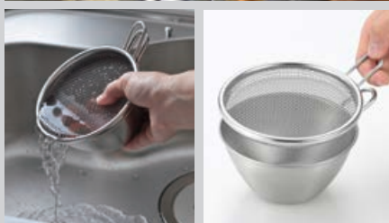
and Stainless Steel Handled Strainer 13cm Shallow Type AN0211 4979487 402118

Crafted with a sturdy and rigid mesh, this shallow type is versatile. Suitable for tasks such as mashing potatoes, preparing baby food, and draining tofu. The perfect size to complement the "and" series handled bowl. Dishwasher safe.