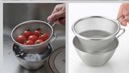
and Stainless Steel Handled Strainer 13cm Deep Type AN0212 4979487 402125

Featuring a rigid mesh and molded legs, this durable deep type is easy to clean. The convenient compact size is incredibly useful for everyday cooking. Its perfect fit with the "and" series handled bowl expands its versatility. Dishwasher safe.