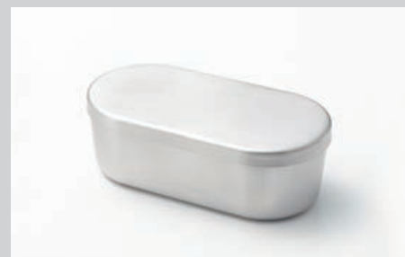
AN0203 and oval type can 4979487 402033

Oval Miniature small can. Use it to hold fruit that doesn't fit in your lunchbox, or use it to store cheese, nuts, and other snacks. Due to its stainless construction, it cools quickly in the fridge and is easy to clean.