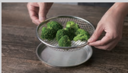
and Stainless Steel Shallow Strainer 16cm AN0215 4979487 402156

A shallow strainer that fits perfectly into a 16cm handled bowl. Convenient mesh design for cooling and draining boiled items. Its simple design is not intrusive, making it suitable for tabletop use. Easy to clean with its durable mesh. Dishwasher safe.